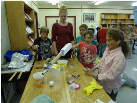
Creating a "machine" to lift a Styrofoam ball.